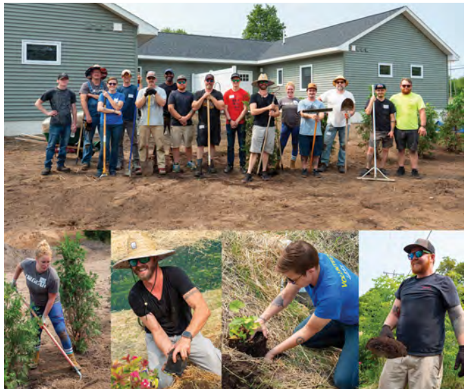
The team from Oil Gear volunteering to landscape the common areas in Habitat's Maple City Crossings.