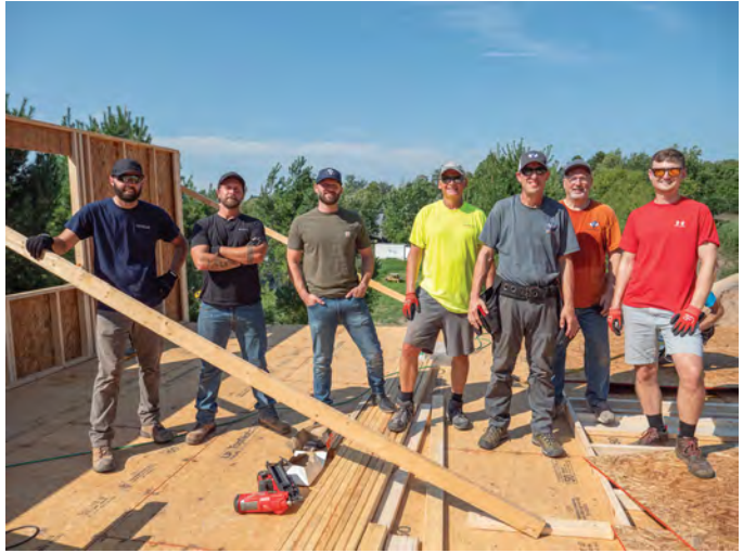
Staff from Cunningham-Limp Development volunteering to help build the last Maple City Crossings home.